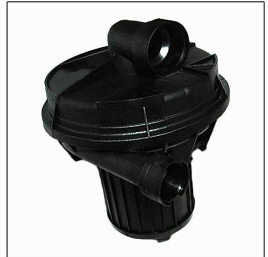
secondary air pump CODE: 8029600

For the reduction of these pollutants, the Secondary Air Pump injects atmospheric air in the exhaust outlet, which oxidizes the hydrocarbons and reduces them to carbon dioxide and water. The heat that is emitted during this procedure, additionally heats the lambda sensor and the correct mixture adjustment is achieved in a shorter period of time.